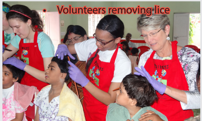
• Volunteers removing lice