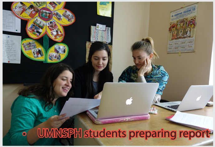
• UMNSPH students preparing report