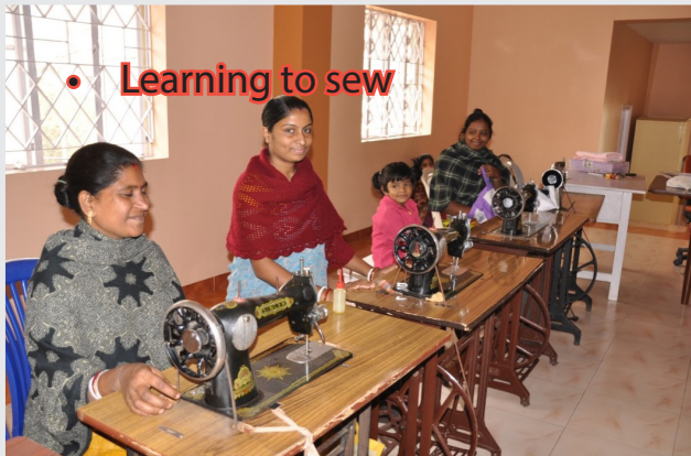
• Learning to sew