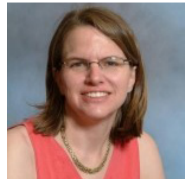
PATHWAYS BOARD MEMBER

One seminarian's reflection: "The price for charity is my life. And from this trip, it is clearly worth it. My experience in India was full. Not always fulfilling, but always full. It was a tremendous opportunity. It asked very little of me and gave me much more than I expected. I am indebted to this trip for its formative assistance in purifying and directing my heart towards God."