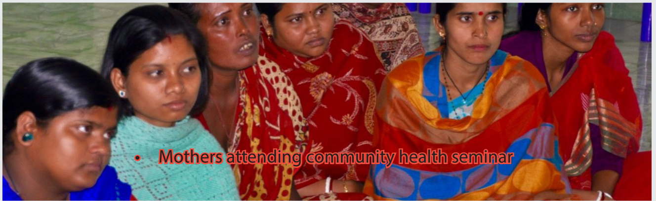
• Mothers attending community health seminar