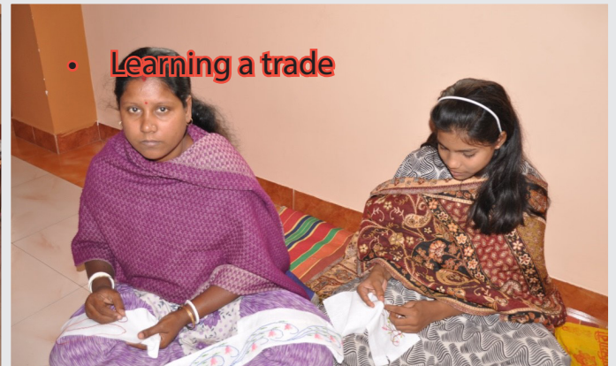
• Learning a trade