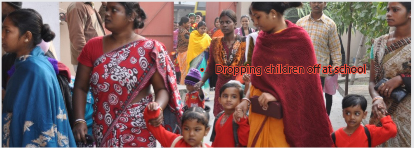
• Dropping children off at school