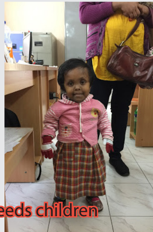
• Happy special needs children