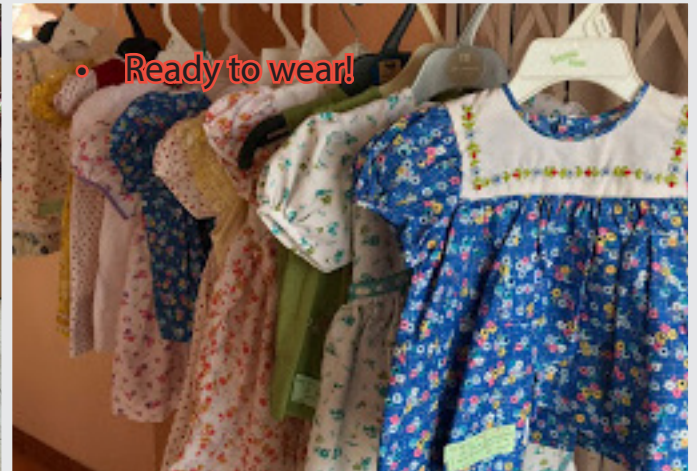
• Ready to wear!