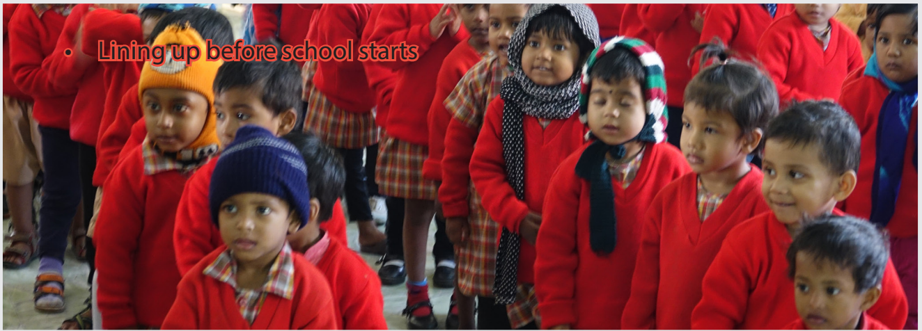
• Lining up before school starts