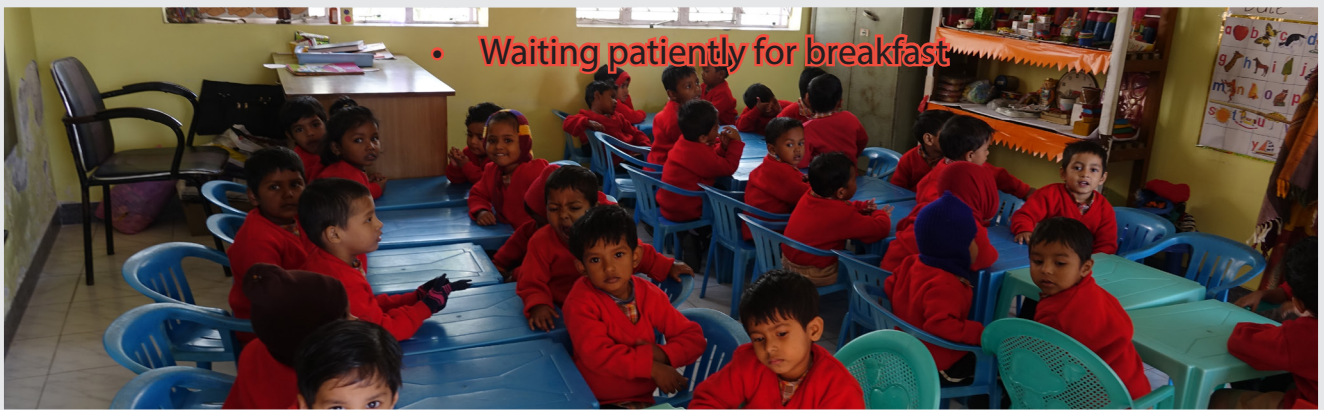
• Waiting patiently for breakfast