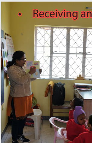
• Receiving an education