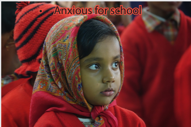
• Anxious for school