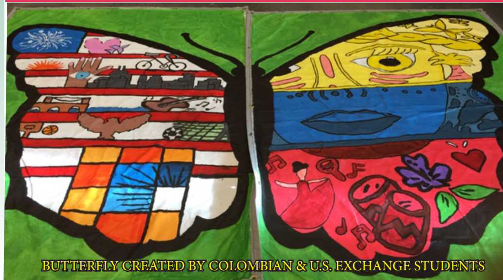
BUTTERFLY CREATED BY COLOMBIAN & U.S. EXCHANGE STUDENTS